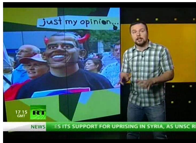
Messaging on RT prior to the US presidential election (RT, 3 November)