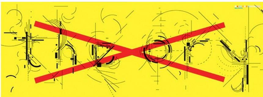
“All models are wrong, but some are useful.” So proclaimed statistician George Box 30 years ago, and he was right. But what choice did we have? Only models, from cosmological equations to theories of human behavior, seemed to be able to consistently, if imperfectly, explain the world around us. Until now. Today companies [...]