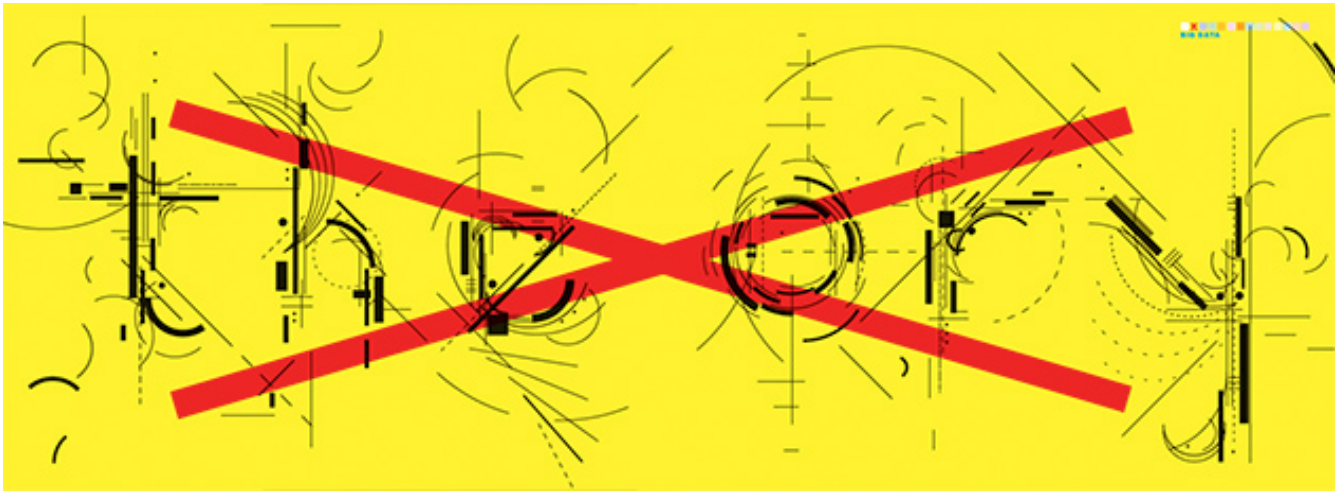
"All models are wrong, but some are useful."

So proclaimed statistician George Box 30 years ago, and he was right. But what choice did we have? Only models, from cosmological equations to theories of human behavior, seemed to be able to consistently, if imperfectly, explain the world around us. Until now. Today companies like Google, which have grown up in an era of massively abundant data, don't have to settle for wrong models. Indeed, they don't have to settle for models at all.