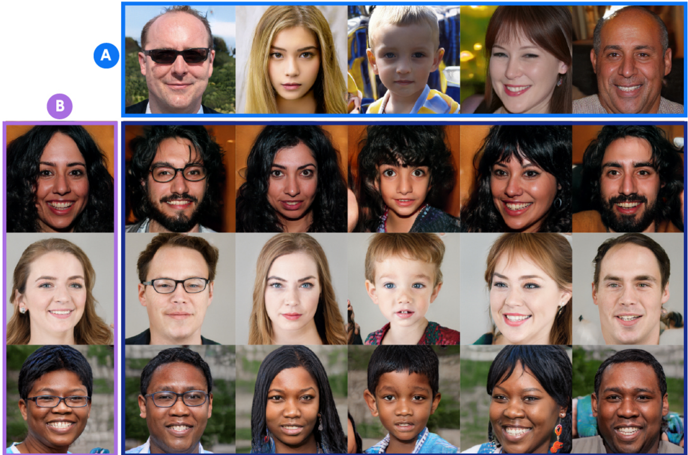
Result of combining A + B

None of these faces is real. The faces in the top row (A) and left-hand column (B) were constructed by a generative adversarial network (GAN) using building-block elements of real faces. The GAN then combined basic features of the faces in A, including their gender, age and face shape, with finer features of faces in B, such as hair color and eye color, to create all the faces in the rest of the grid.