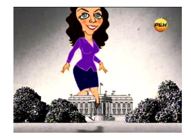
Simonyan steps over the White House in the introduction from her short-lived domestic show on REN TV (REN TV, 26 December 2011)

Wall Street greed, and the US national debt. Some of RT's hosts have compared the United States to Imperial Rome and have predicted that government corruption and "corporate greed" will lead to US financial collapse (RT, 31 October, 4 November).