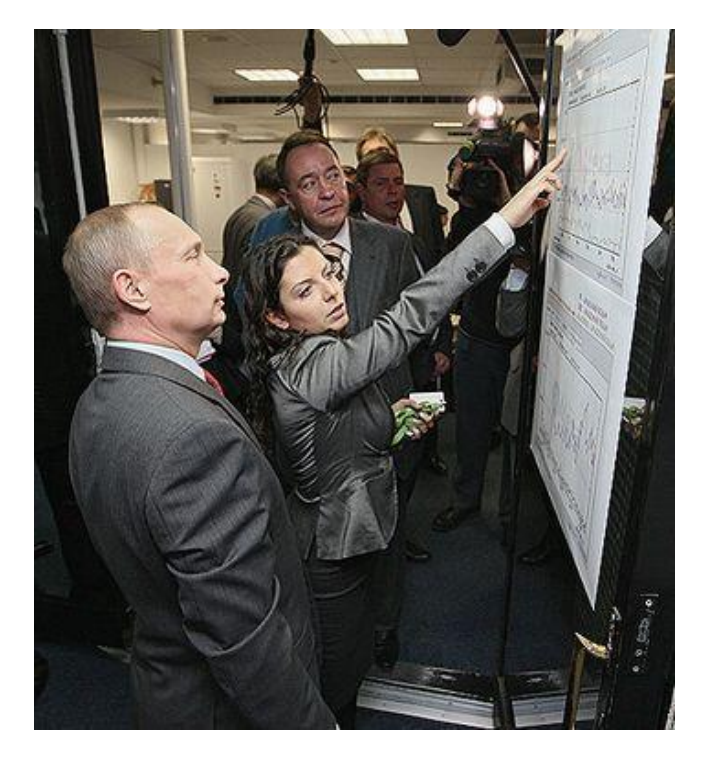
Simonyan shows RT facilities to then Prime Minister Putin. Simonyan was on Putin's 2012 presidential election campaign staff in Moscow (Rospress, 22 September 2010, Ria Novosti, 25 October 2012).

The Kremlin staffs RT and closely supervises RT's coverage, recruiting people who can convey Russian strategic messaging because of their ideological beliefs.