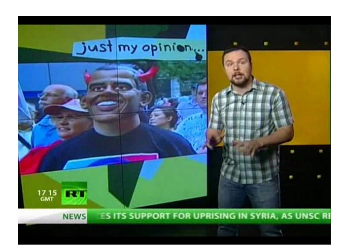
Messaging on RT prior to the US presidential election (RT, 3 November)

party candidate debates and ran reporting supportive of the political agenda of these candidates. The RT hosts asserted that the US two-party system does not represent the views of at least one-third of the population and is a "sham."