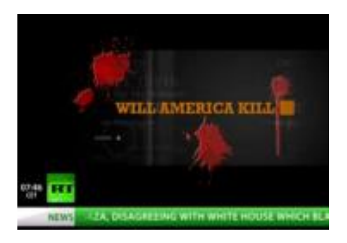
RT new show "Truthseeker" (RT, 11 November)

RT aired a documentary about the Occupy Wall Street movement on 1, 2, and 4 November. RT framed the movement as a fight against "the ruling class" and described the current US political system as corrupt and dominated by corporations. RT advertising for the documentary featured Occupy movement calls to "take back" the government. The documentary claimed that the US system cannot be changed democratically, but only through "revolution." After the 6 November US presidential election, RT aired a documentary called "Cultures of Protest," about active and often violent political resistance (RT, 1-10 November).