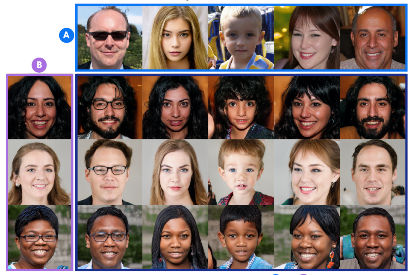
Result of combining A + B

None of these faces is real. The faces in the top row (A) and left-hand column (B) were constructed by a generative adversarial network (GAN) using building-block elements of real faces. The GAN then combined basic features of the faces in A, including their gender, age and face shape, with finer features of faces in B, such as hair color and eye color, to create all the faces in the rest of the grid.