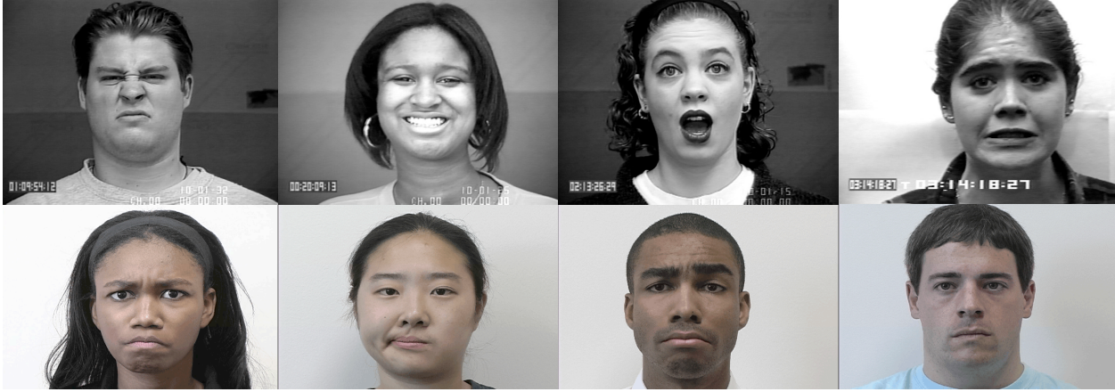
Figure 1. Examples of the CK+ database. The images on the top level are subsumed from the original CK database and those on the bottom are representative of the extended data. All up 8 emotions and 30 AUs are present in the database. Examples of the Emotion and AU labels are: (a) Disgust - AU 1+4+15+17, (b) Happy - AU 6+12+25, (c) Surprise - AU 1+2+5+25+27, (d) Fear - AU 1+4+7+20, (e) Angry - AU 4+5+15+17, (f) Contempt - AU 14, (g) Sadness - AU 1+2+4+15+17, and (h) Neutral - AU0 are included.