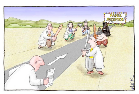
Most scientists regarded the new streamlined peer-review process as 'quite an improvement.'

The review can be internal (done by editorial staff) or external