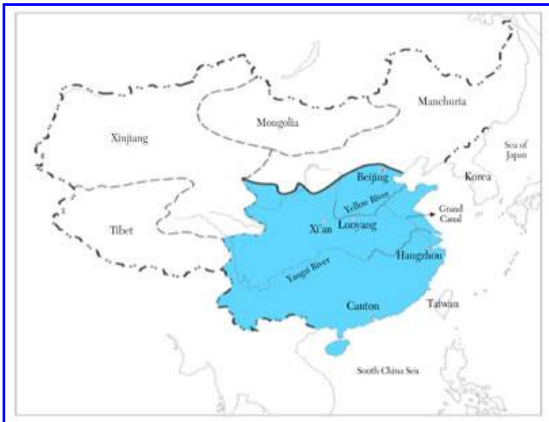
Map 1. Chinese Territory under Ming (shaded) and Qing

reform initiatives of the late 1970s. Finally, we briefly examine the growth spurt following China's post-1978 reforms with an eye to continuities, as well as departures from historic patterns.